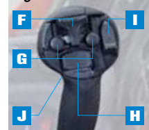
Right Control Lever